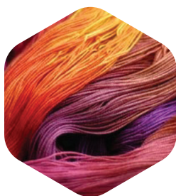
Textile Dying & Printing