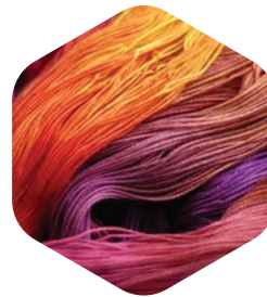
Textile Dying & Printing