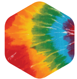
Tie & Dye Industries